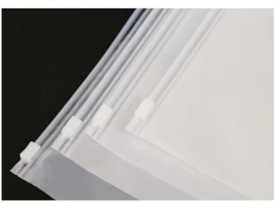
Quick closure Easy to store, user-friendly design, Convenient and easy.