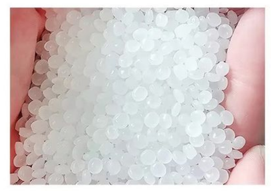
PE、EVA materials Biodegradable materials, use more environmentally friendly.