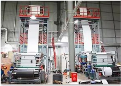
① Blowing flim