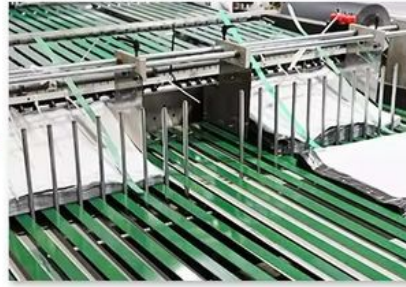
③ Making bags