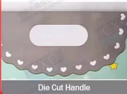
Die Cut Handle