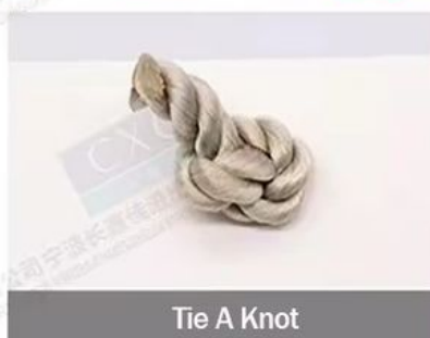
Tie A Knot