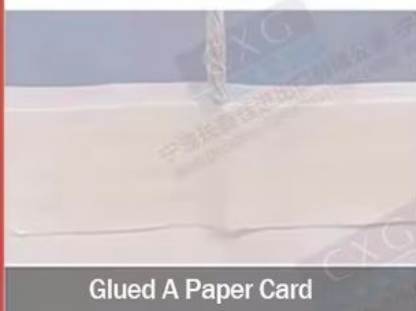
Glued A Paper Card